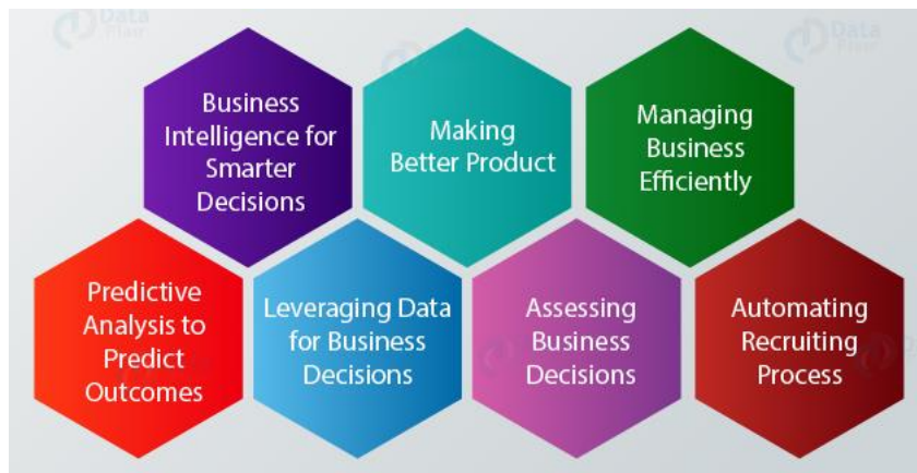
Figure 2. Importance of data science in business (Data-Flair, 2021)

Data science can add value to any business that can make good use of its data. From statistics and insights on workflows and hiring new employees, to helping senior executives make better decisions, information is valuable to any company in any industry. The use of data analysis in business is the business that firms can no longer ignore (Deighan, 2016). The macro data is sometimes complicated and difficult to understand, but the jobs that implement systems and strategies to collect, analyze, and use the data experience good benefits in different fields of their performance (Data-Flair, 2021). The Importance of data science in business is shown in Figure 2.